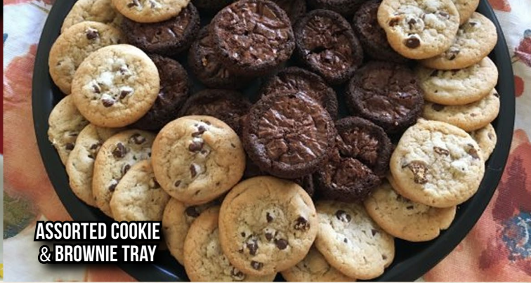
ASSORTED COOKIE & BROWNIE TRAY