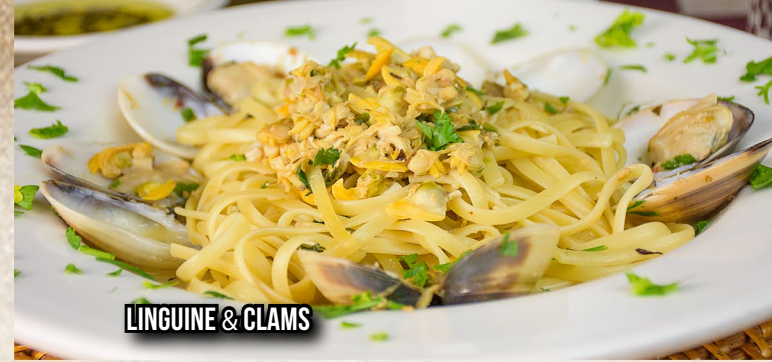
LINGUINE & CLAMS

Sautéed in a Spicy Tomato Sauce with Mushrooms and Kalamata Olives add 9.95 / 19.95 add Chicken 24.95 / 39.95 add Shrimp 29.95 / 49.95