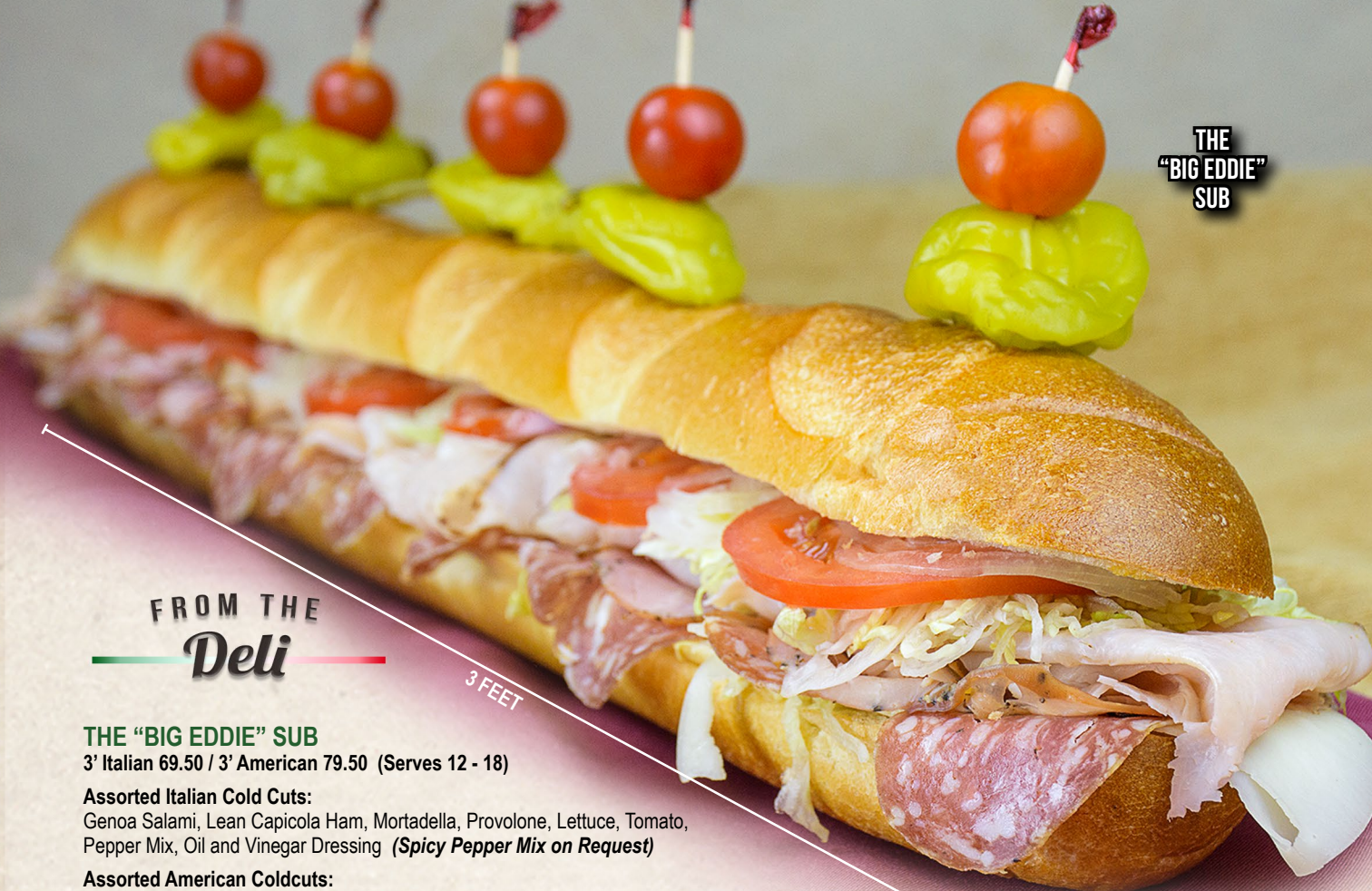
THE "BIG EDDIE" SUB